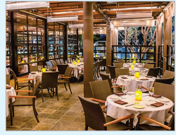
Sunday, Parts Exchange followed by a champagne brunch at Bayside Restaurant.